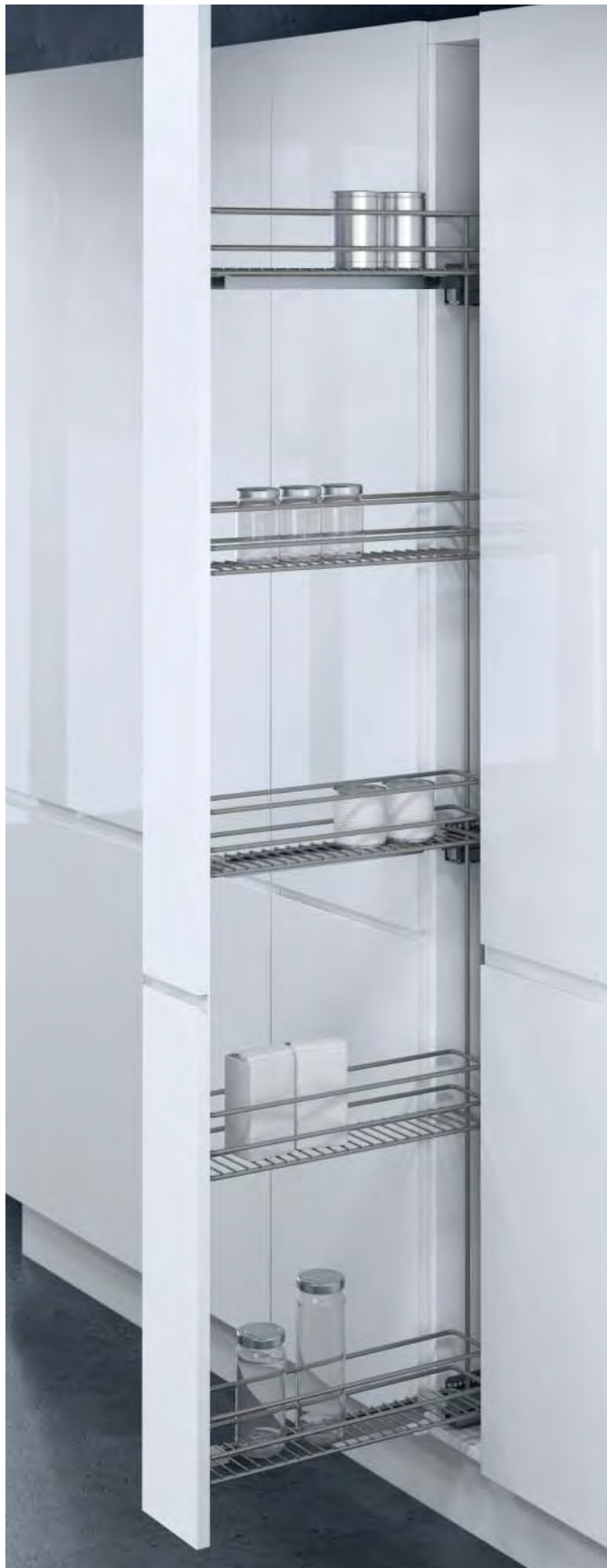
Larder unit with storage baskets