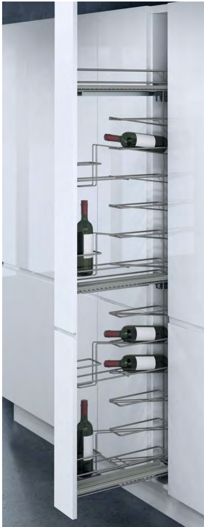
Larder unit with wine racks

KITCHEN ACCESSORIES 2015, © Hafele U.K. Ltd 2015. Dimensional data not binding. We reserve the right to alter specifications without notice.